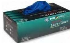
High-Risk Blue Latex Gloves