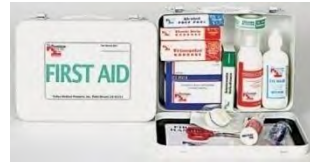
16 Unit First Aid Cabinet