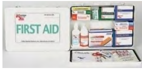
10 Unit First Aid Cabinet