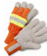
Water-Proof Lined High Visibility