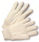
String Knit Gloves