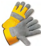
Heavy Duty Leather Palms