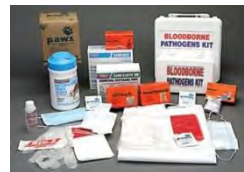
Blood-Born Kit Kit