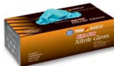
High-Risk Nitrile Gloves