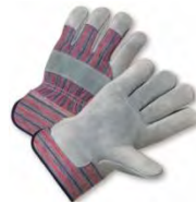
Medium Duty Leather Palms