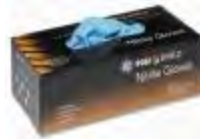
Posi-Shield Nitrile Gloves