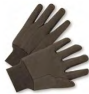
String Knit Gloves