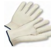
Leather Driving Gloves