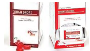
Cough Drops / Lozengers