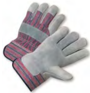
Light Duty Leather Palms