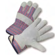
Lined Leather Gloves